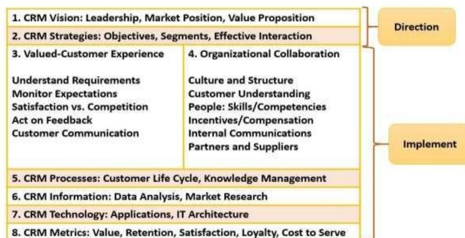
Figure 4: Customer Relationship Management Strategies

The Gartner Competency Model suggests that companies need competencies in eight main areas for company's Customer Relationship Management initiative to be successful (Gartner, 2013). It should provide objectives, segments and customers and it should define how resources will be used in interactions. This involves ensuring that the propositions have value to the customer and the enterprise, achieve the desired market position and are delivered consistently across channels. This involves the transformation of culture, structures and behaviours to ensure that staff, partners and suppliers work together to deliver what is promised. Critical to ensuring end user acceptance of new behaviours and enabling technology is a solid change management strategy. Successful enterprises leverage data and information management, customer-facing applications, and supporting IT infrastructure and architecture to enable Customer Relationship Management as shown in Figure 4.