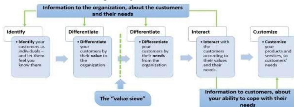
Figure 1: Model of Customer Relationship Management

The IDIC Model was developed by Peppers and Rogers Group and based on its main concept, companies should take four actions in order to build closer one-to-one relationships with their customers: Identify, Differentiate, Interact and Customise. Relations between mentioned actions are presented graphically in Figure 1 (Grazdane, 2013).