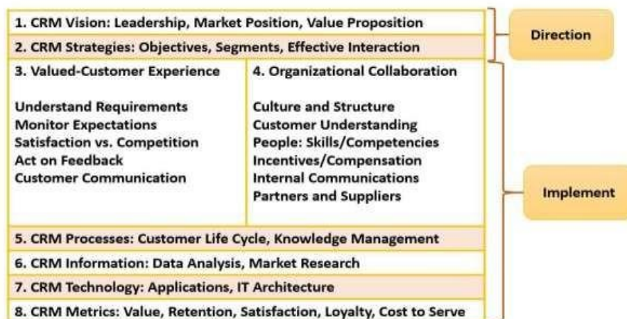
Figure 4: Customer Relationship Management Strategies

The Gartner Competency Model suggests that companies need competencies in eight main areas for company’s Customer Relationship Management initiative to be successful (Gartner, 2013). It should provide objectives, segments and customers and it should define how resources will be used in interactions. This involves ensuring that the propositions have value to the customer and the enterprise, achieve the desired market position and are delivered consistently across channels. This involves the transformation of culture, structures and behaviours to ensure that staff, partners and suppliers work together to deliver what is promised. Critical to ensuring end user acceptance of new behaviours and enabling technology is a solid change management strategy. Successful enterprises leverage data and information management, customer-facing applications, and supporting IT infrastructure and architecture to enable Customer Relationship Management as shown in Figure 4.